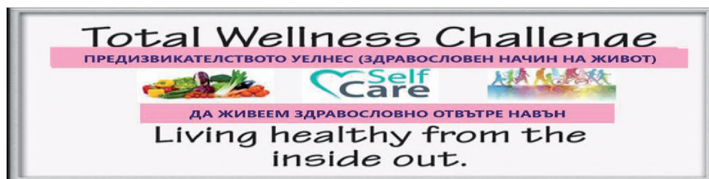
Figure 4. The architecture of personal health care for achieving a Wellness lifestyle.

We conducted a psychometric experiment to prove the social significance of an authorial innovative Wellness Cluster. We used new Wellness procedures and treatments applying Bulgarian products from natural heritage. We recorded the opinions of men and women, regular users of Wellness and restorative products and services. These opinions were statistically processed using specialized methodology to determine the weight of significance for each factor/indicator. The results obtained from the preference matrices and the ranking of factors determining the social impact and internationalization of the developed innovative Wellness Cluster (as a product) are presented in Table 1 and Figures 5, and 6. Table 1 presents the number of individuals and the corresponding weight of the factor for its ranking position through the