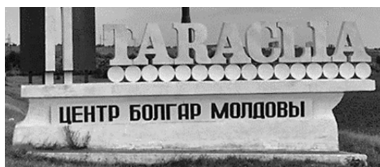
Figure 3: Monolingual Russian text