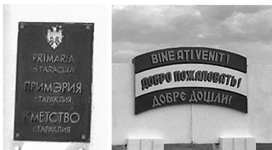
Figure 5: Romanian-Russian-Bulgarian Trilingual text