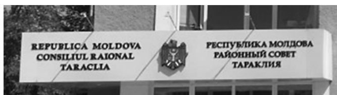
Figure 2: Romanian-Russian text