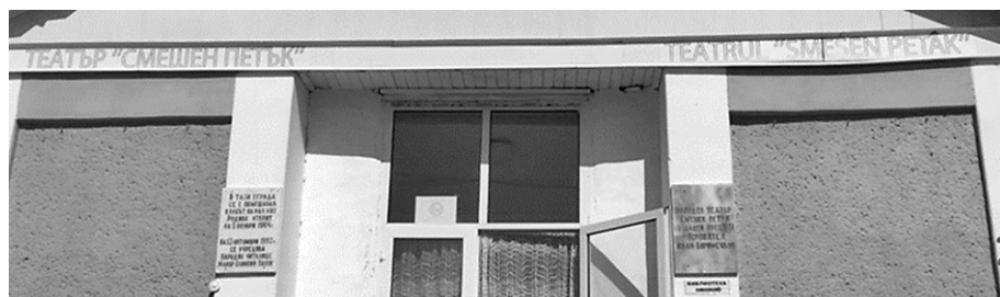
Figure 4: Bulgarian-Romanian text